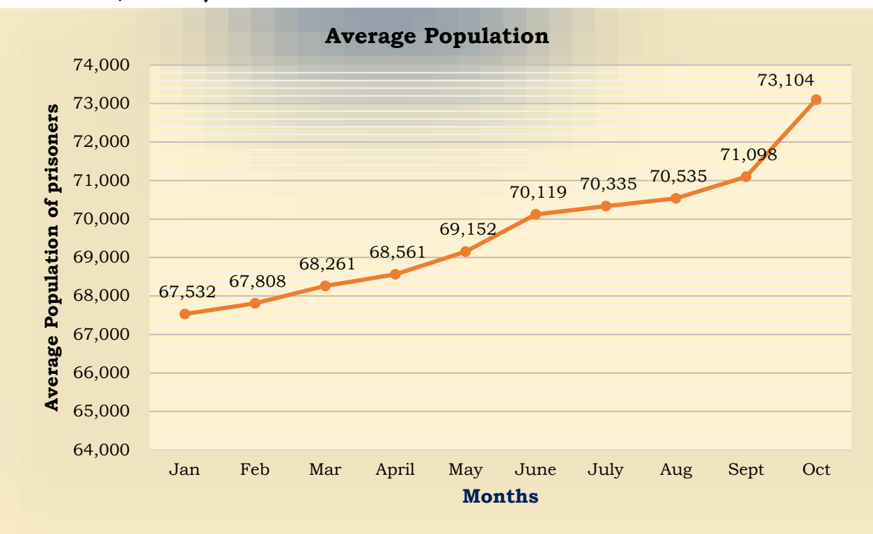
1.3. Monthly Population Trend of Prisoners (January to October, 2022)