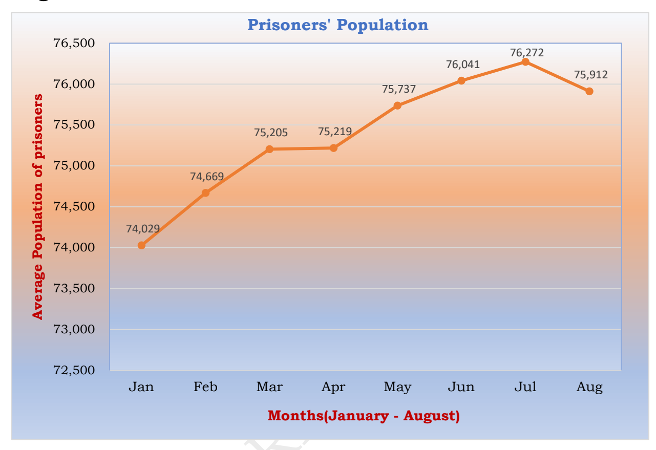
Figure 2: Trend of prisoners' population growth for the period from January to August 2023.